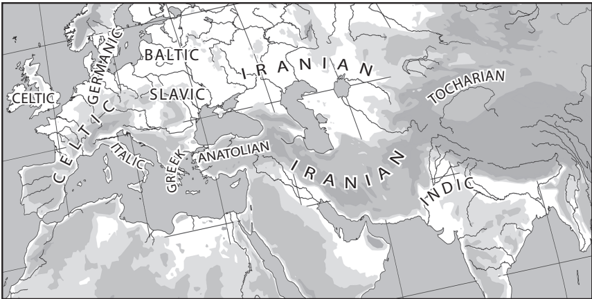
Figure 1.2 The approximate geographic locations of the major Indo-European branches at about 400 BCE.

Linguists have reconstructed the sounds of more than fifteen hundred Proto-Indo-European roots. 12 The reconstructions vary in reliability, because they depend on the surviving linguistic evidence. On the other hand, archeological excavations have revealed inscriptions in Hittite, Mycenaean Greek, and archaic German that contained words, never seen before, displaying precisely the sounds previously reconstructed by comparative linguists. That linguists accurately predicted the sounds and letters later found in ancient inscriptions confirms that their reconstructions are not entirely theoretical. If we cannot regard reconstructed Proto-Indo-European as literally “real,” it is at least a close approximation of a prehistoric reality.